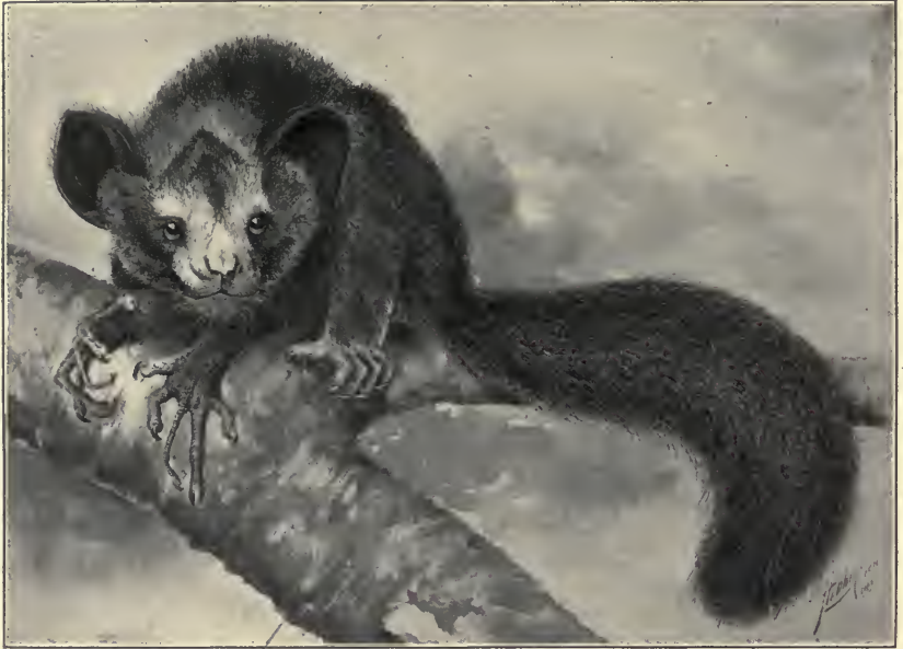
FIG. LXXX. DAUBENTONIA MADAGASCARIENSIS. AYE-AYE.

Cheiromys (sic) G. Cuv., Leçons Anat. Comp. , 1, 1800.